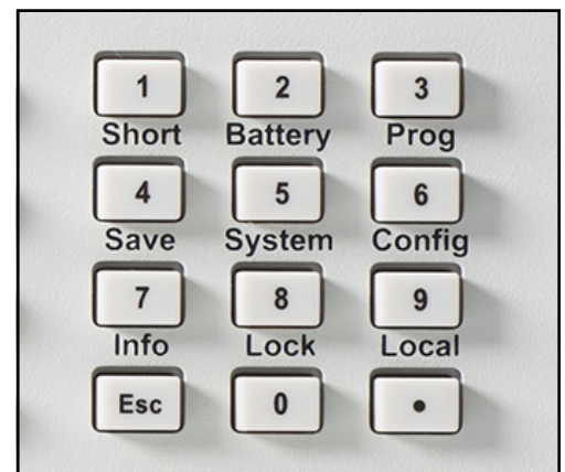
Figure 1. Use either the rotary knob or the keypad to quickly enter settings and set parameter values using all the available resolution.