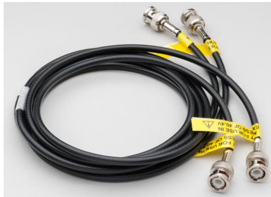
Figure 1: Model 2601B-PULSE-CA2 Coaxial Cables

These cables are intended for use with the Model 2601B-PULSE System SourceMeter ® instrument with the 2601B-P-INT Interlock and Cable Connector Box installed.