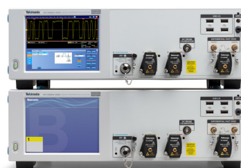
DP070000SX ATI Performance Oscilloscope

Get in touch with us @ asean.mktg@tektronix.com